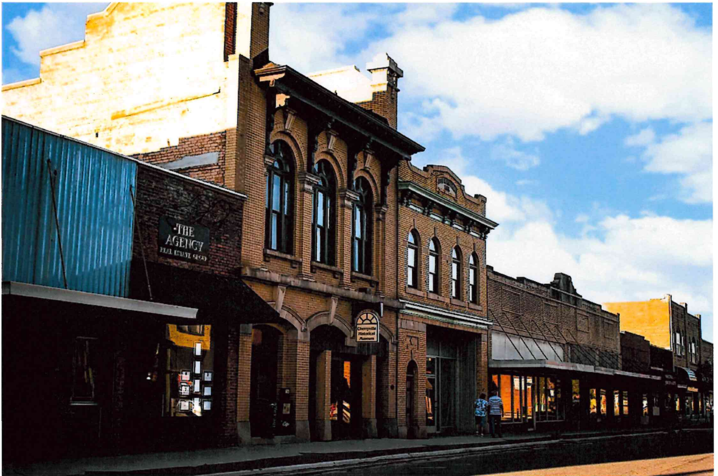
Downtown Cherryville, North Carolina.

This small town of Gaston County is steeped in German heritage and enjoys a robust sense of community that allows for peaceful co-existence. Cherryville hosts a string of festivals throughout the year, helping to maintain strong bonds among residents. This includes the Cherryville Cherry Blossom Festival, an enduring tradition celebrated with good food, live music, and fun rides. The Cherryville Historical Society expertly preserves and interprets the area's