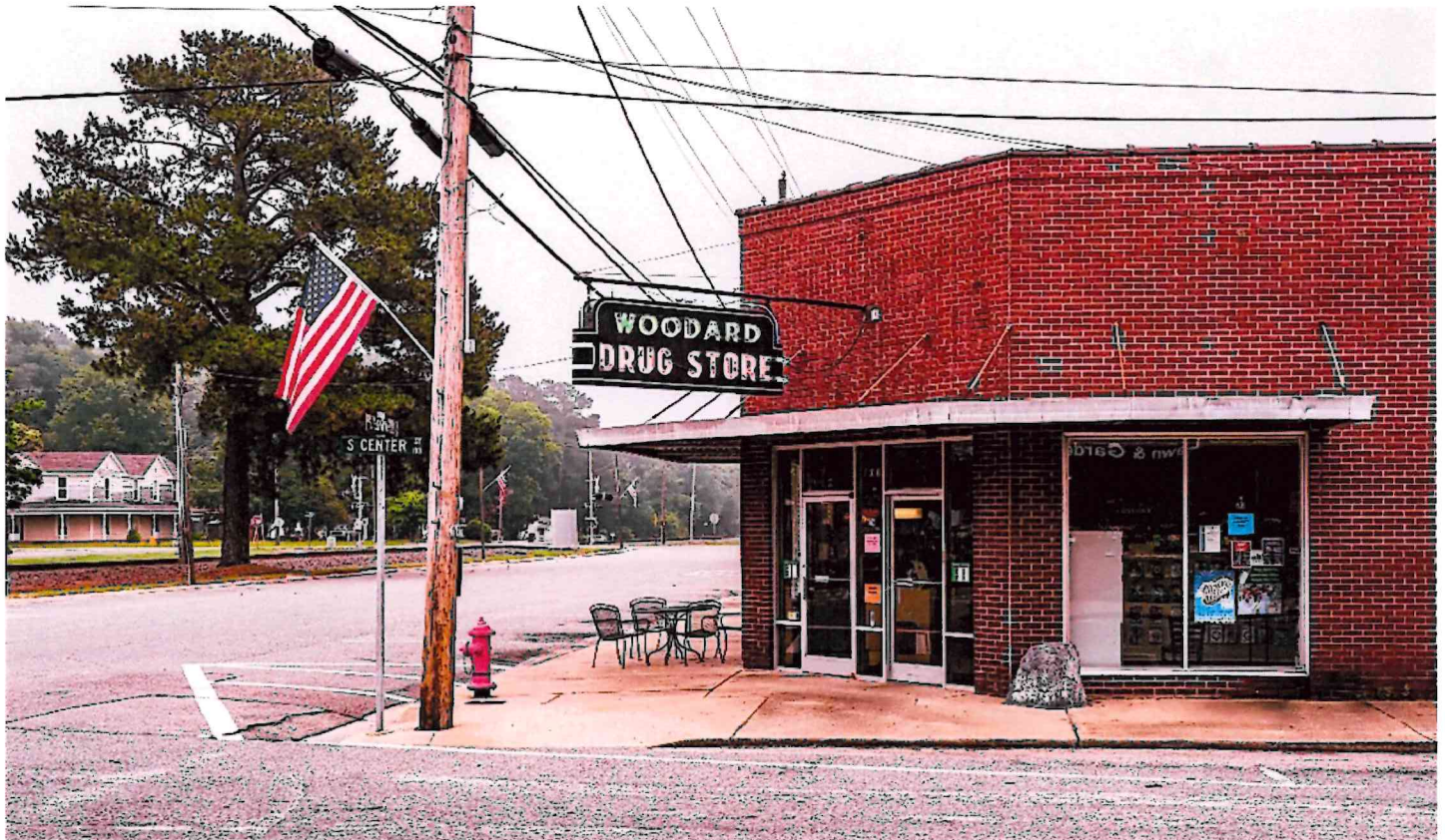
Downtown drugstore in Princeton, North Carolina.

Princeton sits less than an hour from Raleigh and is known for hosting a hospitable community that makes strangers feel right at home. This means it takes a short time for incoming residents to settle in and make acquaintances, especially during social events like the Princeton Community Day. Townspeople like to gather on the lush grounds of Ray M. Floors Community Park to make the most of their recreational needs. The quaint space provides amenities like picnic spots, playground equipment, and a toddler play area, accommodating the whole family.