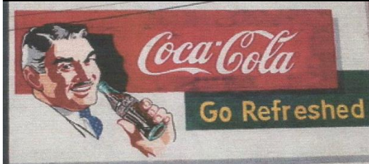
RENDERING OF THE LAST COCA-COLA MURAL