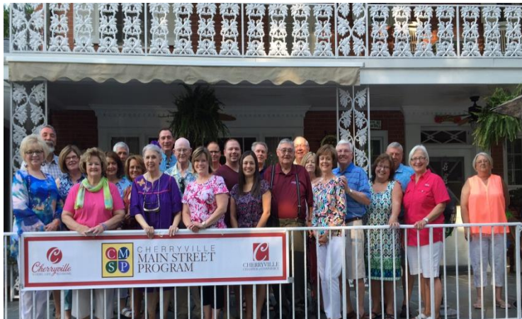
CMSP VOLUNTEERS AND SUPPORTERS GATHER TO CELEBRATE A HIGHLY SUCCESSFUL YEAR

During FY2016, volunteers devoted over 2,500 hours working for the revitalization of Cherryville. In addition to the 37 assigned duties the CMSP Committee performs throughout the year, volunteers completed 33 unique tasks for the betterment of our town and initiated 6 other tasks which are currently in progress.