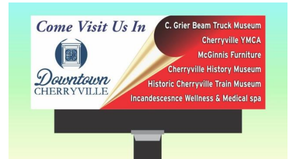
BILLBOARD PLANNED FOR THE BLACK'S GRILL SITE